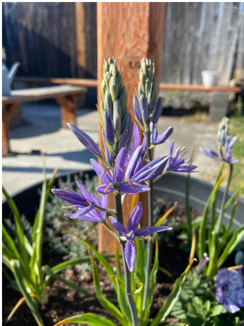
Camas flowers blooming

Extension: Look around your plant for younger flowers just starting to bloom and older flowers turning to fruit or pods. Check back to see if the fruit or pods grow bigger. Look for other flowering plants and see if you can notice flowers turning to pods or fruits. How many can you find?