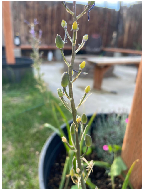
Camas seed pods two weeks later